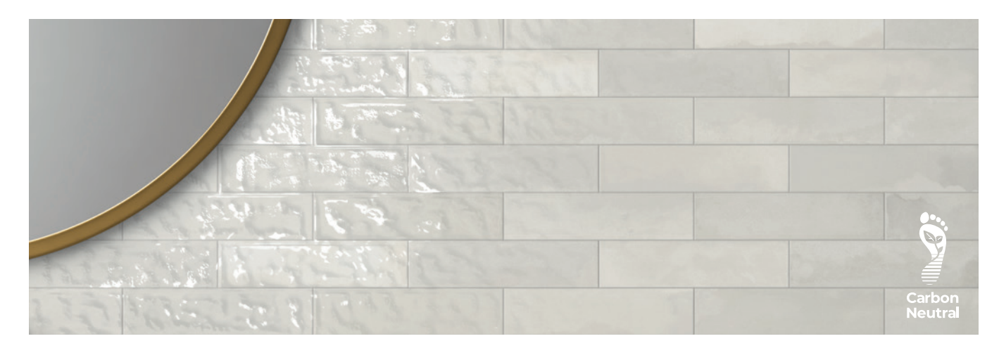
GLACIER 3"x12" - 1104966