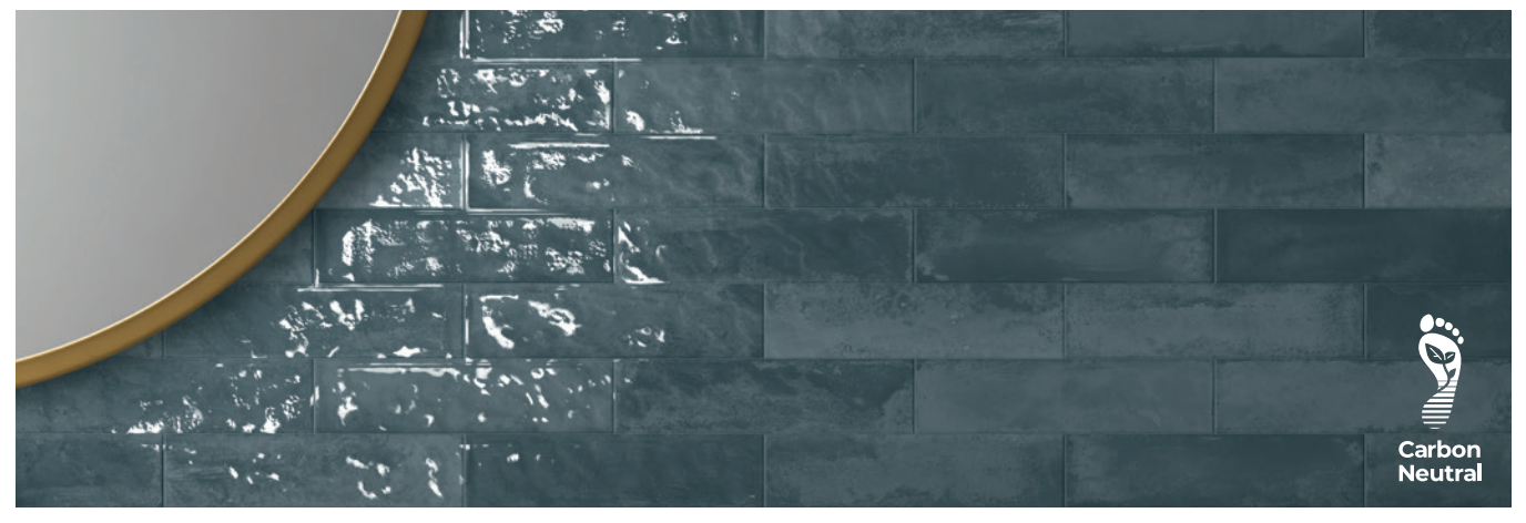
SKY 3"x12" - 1104967