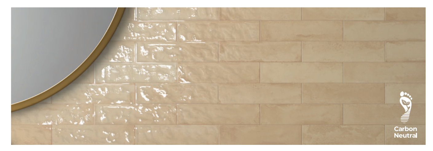
DESERT 3"x12" - 1104970