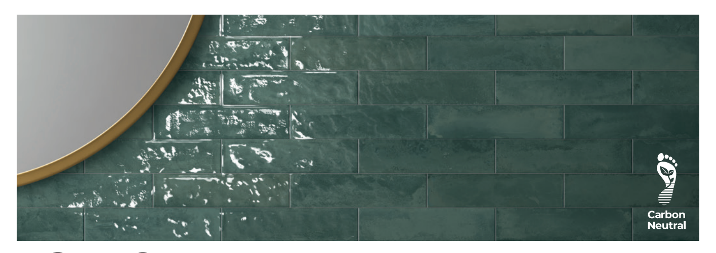
FOREST 3"x12" - 1104969