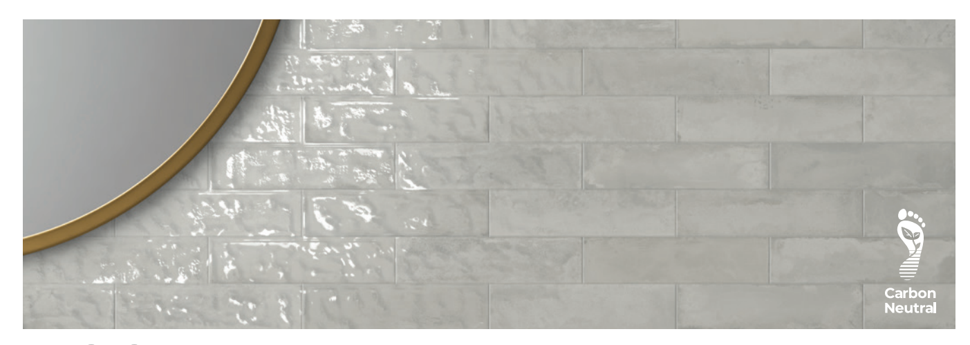
MOON 3"x12" - 1104971