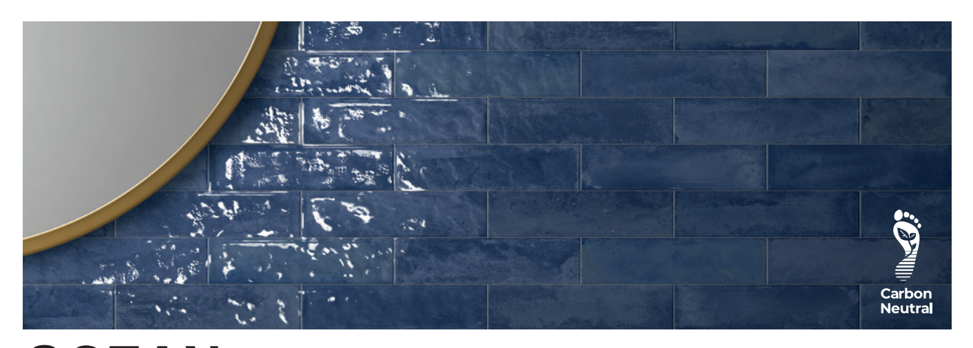
OCEAN 3"x12" - 1104968

Colors shown may vary from actual product. Final selection should be made from actual product samples.